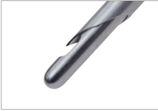
Veress needle tip